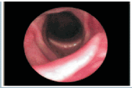
• 1 Display